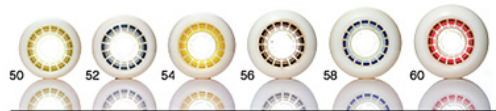
ORIGINAL LINE 98a