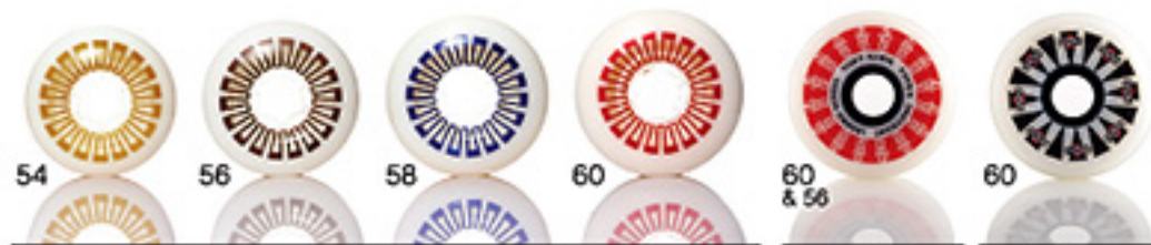
SOFT BLEND 96a